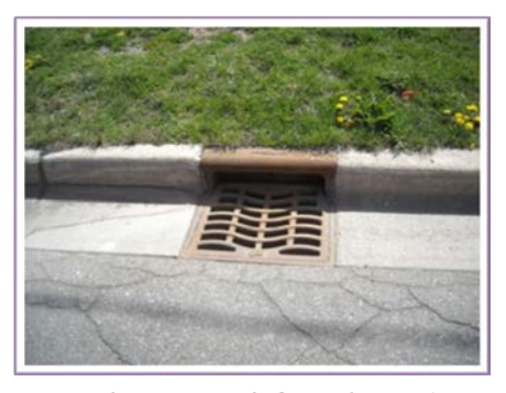
Unobstructed Catch Basin