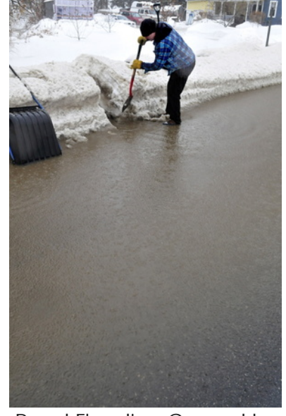
Road Flooding Caused by Obstructed Catch Basins

Safety First: The power of water is frequently underestimated. Never enter an area of flowing water on foot or even in a vehicle. Water only a few inches deep is capable of sweeping an adult off their feet.