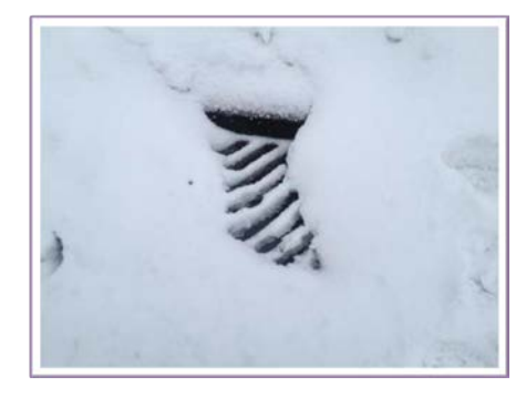
Obstructed Catch Basin