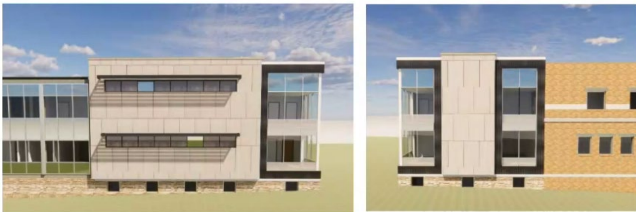
Pictured above: Courthouse Southeast Corner

Courthouse Statue Move (Last Updated on 9/28/23) – Unfortunately, no bids were received from the proposal request released on September 15, 2023. The request for proposal was re-released on October 2, 2023. Since then, at least one contractor has been in contact with the County reporting their interest in submitting a bid. Bid responses are due October 18, 2023.