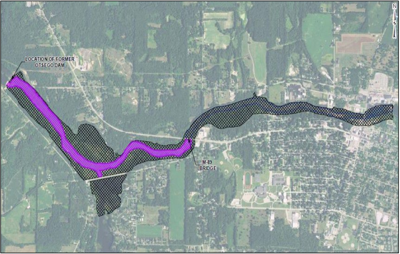
Figure showing area cleaned up by removal action upstream of former Otsego Township Dam, shaded in purple and completed in 2018. Area 3 floodplain areas shown in grey hashing.