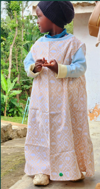
A clover was hand-stitched to the hem of each little dress to symbolize it was sent by 4-H.