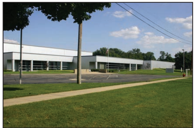
Allegan County Sheriff's Office and Corrections Center