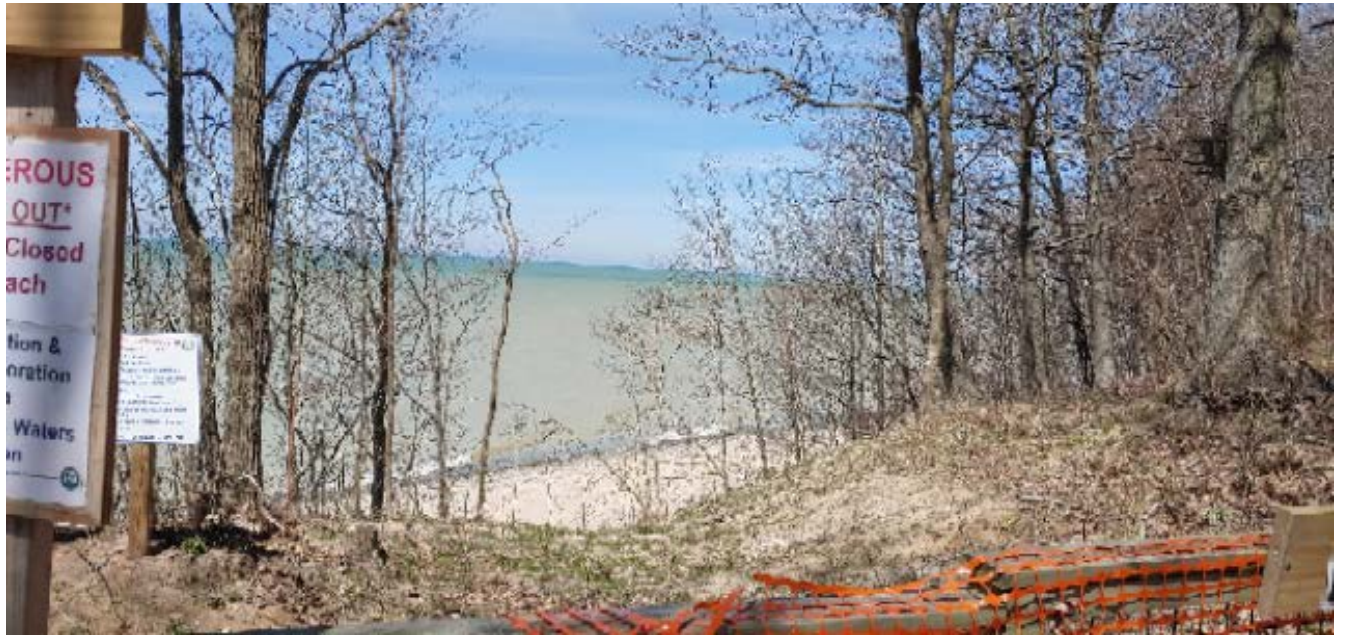
West Side Park – Current State (April 20, 2020)